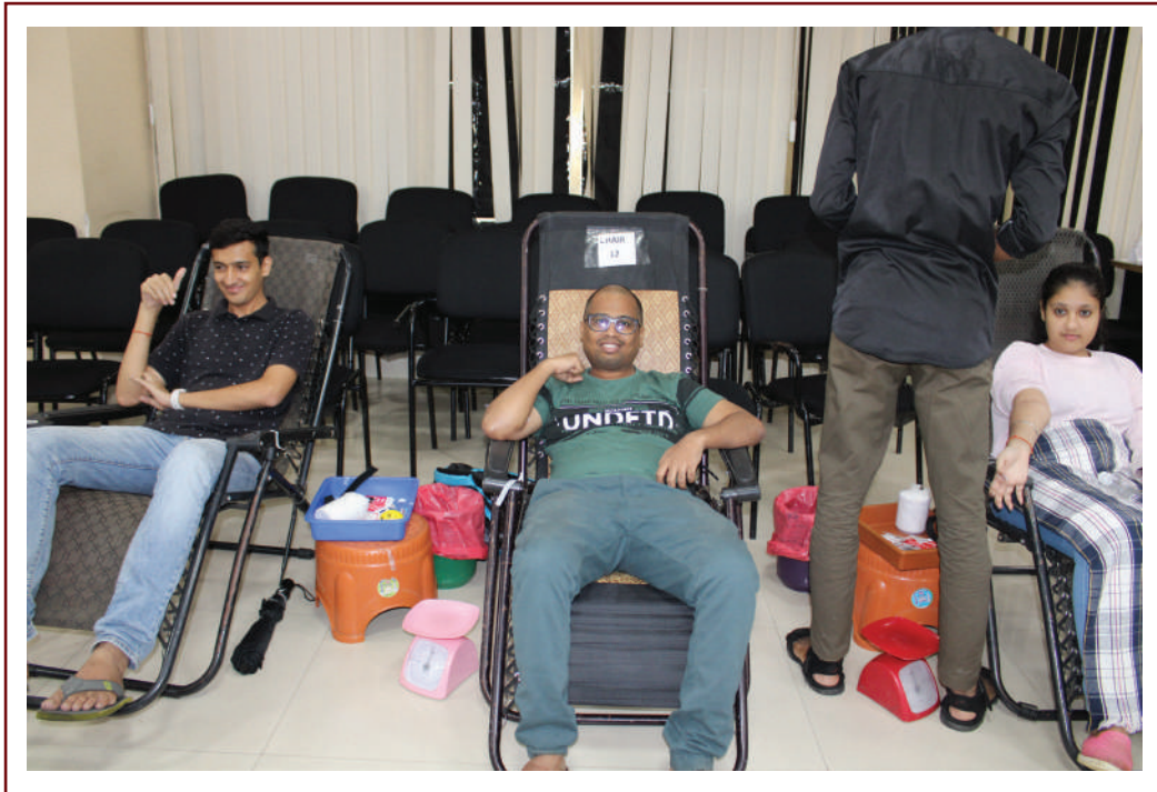
Participants at Blood Donation Camp