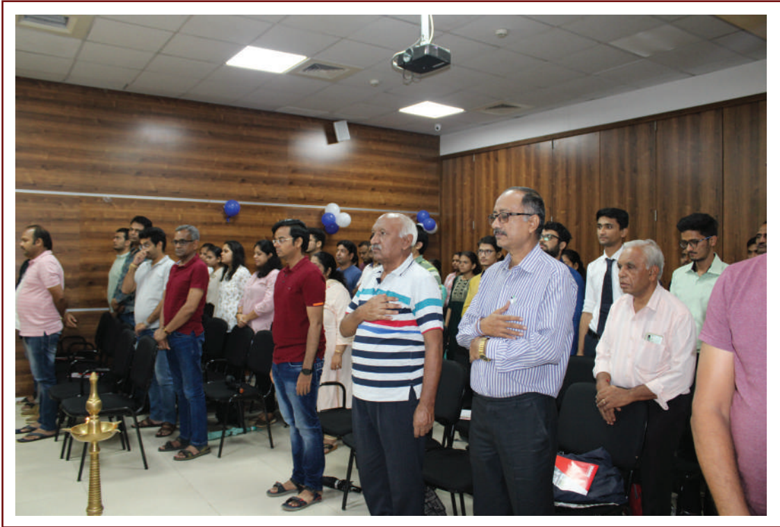
Participants at Seminar on the Whole Gamut of Year End Finalisation (Inc. ITR)