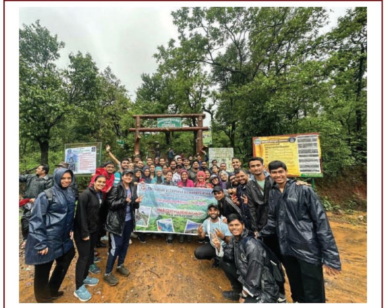
Summitting Peaks of Knowledge and Leadership! Trekking the Harishchandragad Trail