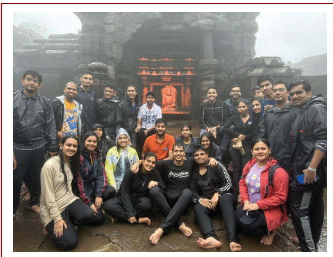
Embarking on a Journey of Wisdom & Endurance